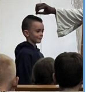
New BUDDY BENCH!!